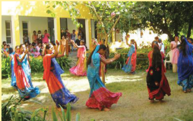
Annual Day Celebration Dance, Drama and Sumptuous Feast