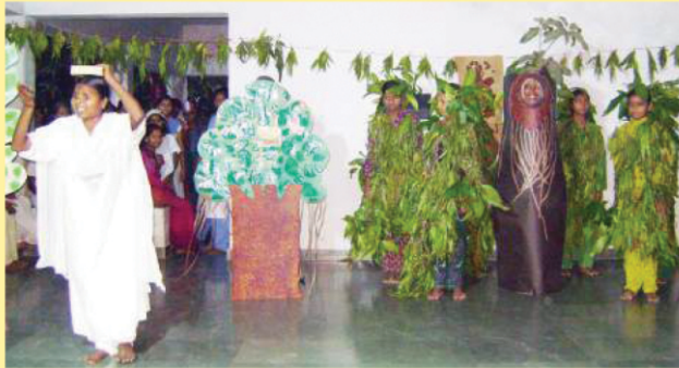
Environment Responsibility Theatre and Dance

To impart quality education to the tribal girls and help them fit into the mainstream while retaining pride in and contact with, their tribal heritage.