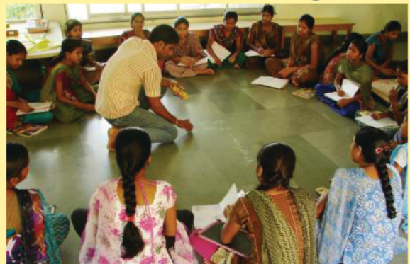
Experiential Learning versus by Rote Learning