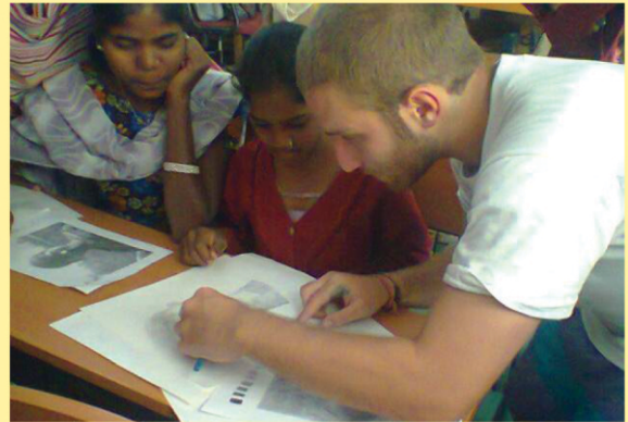
Alternative Inter-Active Teaching Method

We encourage individuals who like to have an opportunity to share their special skill and knowledge with tribal girl students, to come and spend some time at Kedi School