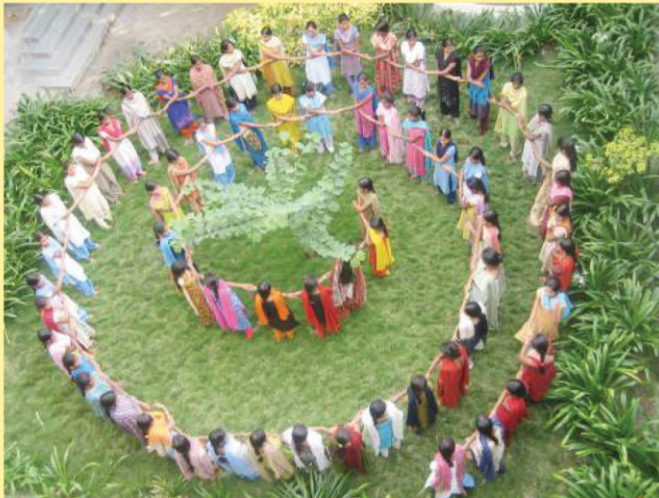
Fun with Learning - Knowing their Rights