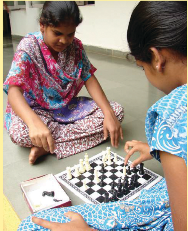
Developing Logical Thinking Chess, Crosswords, Puzzles and Treasure Hunt